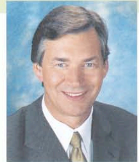
Gary Doer Premier of Manitoba

Manitoba is now a leader in these areas – joining other governments, businesses and citizens who have turned debate on climate change into concrete action. By taking action, Manitoba is seizing new economic opportunities and supporting innovative ideas that will build a sustainable economy while reducing greenhouse gases.